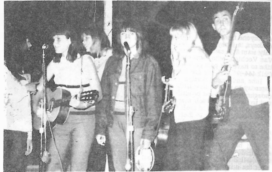
Alpine needs a family tearoom.

It is better to take things as they come than to try to catch them as they go.